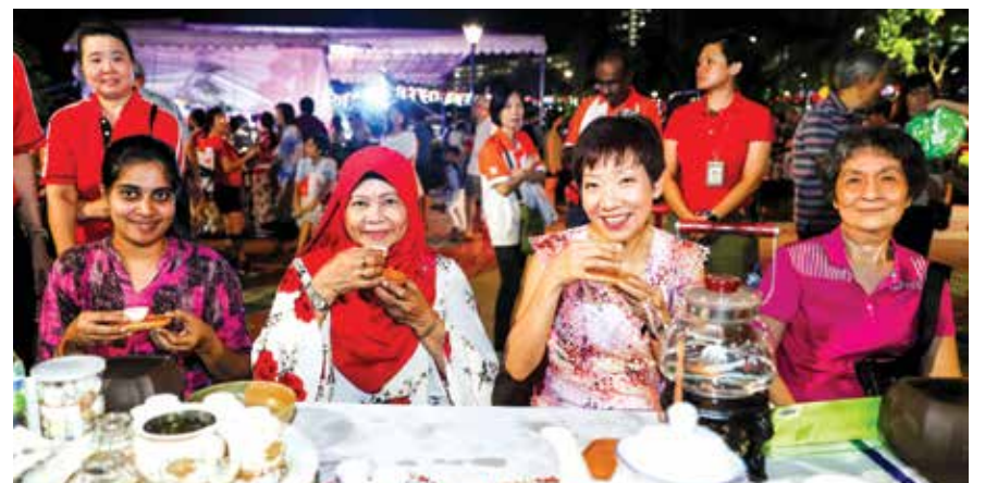
Ms Fu celebrating Mid-Autumn festival with residents of different races