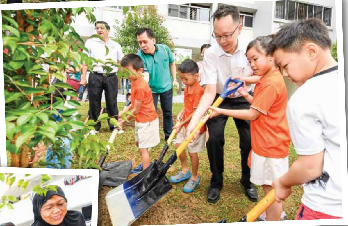
Bukit Batok SMC