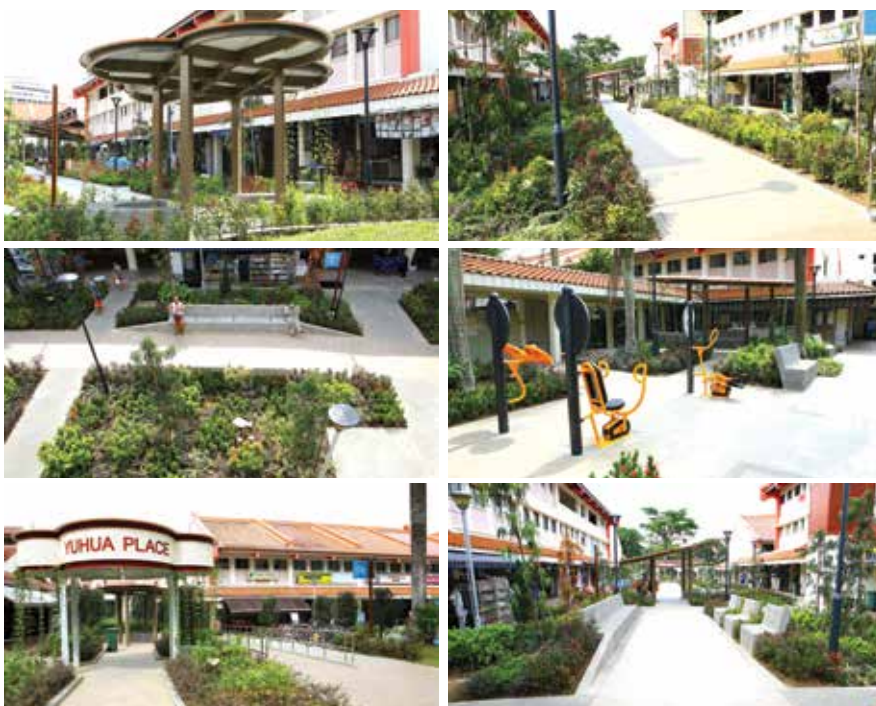
Remaking Our Heartland @ Blocks 342 to 353 Jurong East St 31