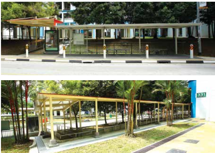
Covered linkway from Block 331 Tah Ching Road to existing bus stop