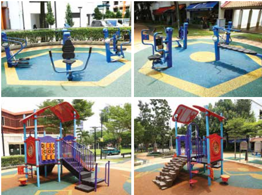
Playground and Fitness Corner @ Block 517 Jurong West St 52