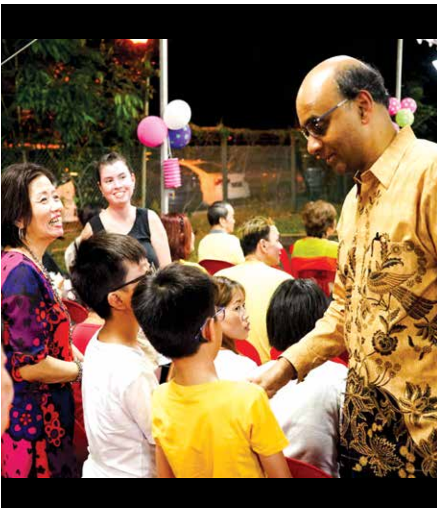
Mr Tharman interacting with residents at a Mid-Autumn festival celebration