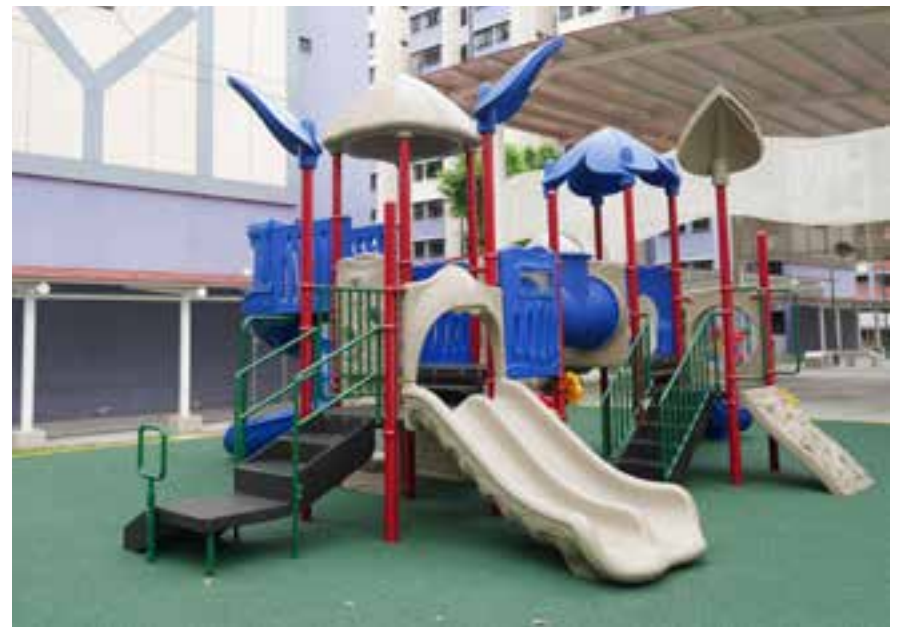
Upgraded playground beside Block 111 Ho Ching Road.