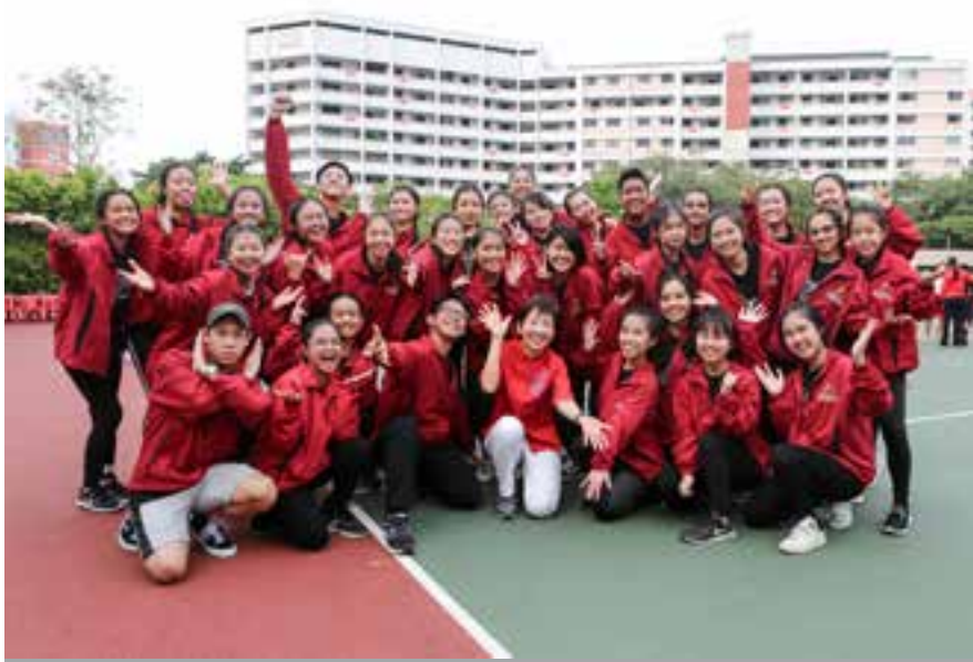
Ms Grace Fu (front row, fourth from right) celebrating National Day with youths.