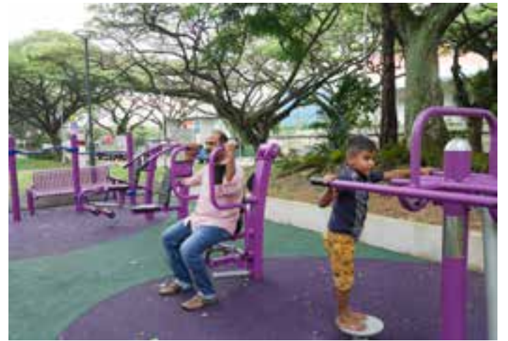
Upgraded multi-generation fitness corner at Block 521 Jurong West Street 52.