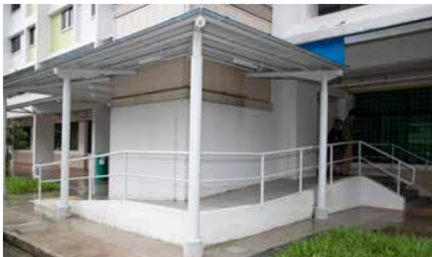
Newly constructed roof over the ramp at Block 428 Clementi Ave 3.