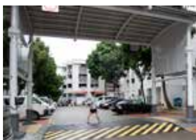
New linkway between Blocks 146 and 148 Bukit Batok West Ave 6.