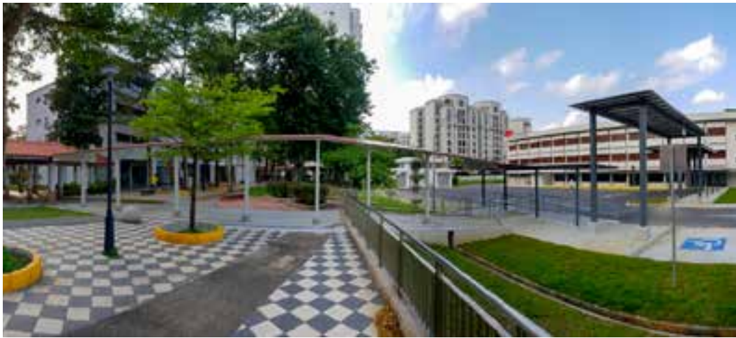
Newly constructed covered linkway from Block 519 Jurong West Street 52 to the National Kidney Foundation (NKF) Integrated Renal Centre.