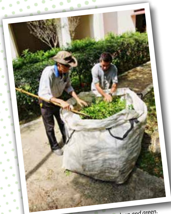
Clearing leaves keeps our streets clean and green.

I provide support to the property managers and officers to ensure that standards of horticulture, arboriculture and turf maintenance are adhered to. This includes managing and supervising contractors to ensure that the horticultural works are carried out properly.