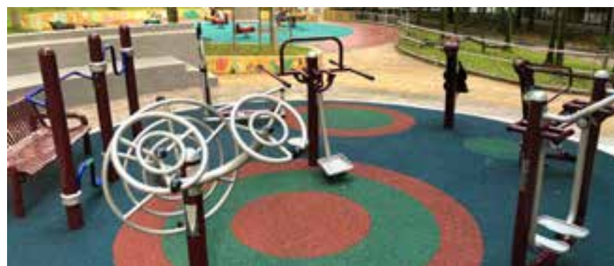
New fitness corner in front of Block 288E Bukit Batok Street 25.