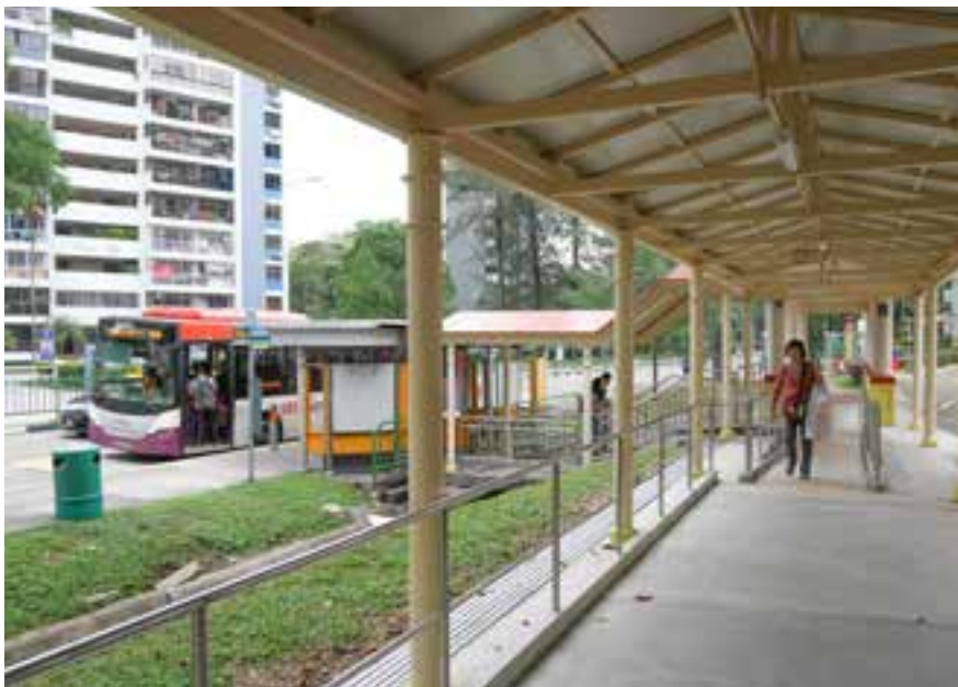
Upgraded covered linkway from Block 322 Tah Ching Road leading to nearest bus stop.