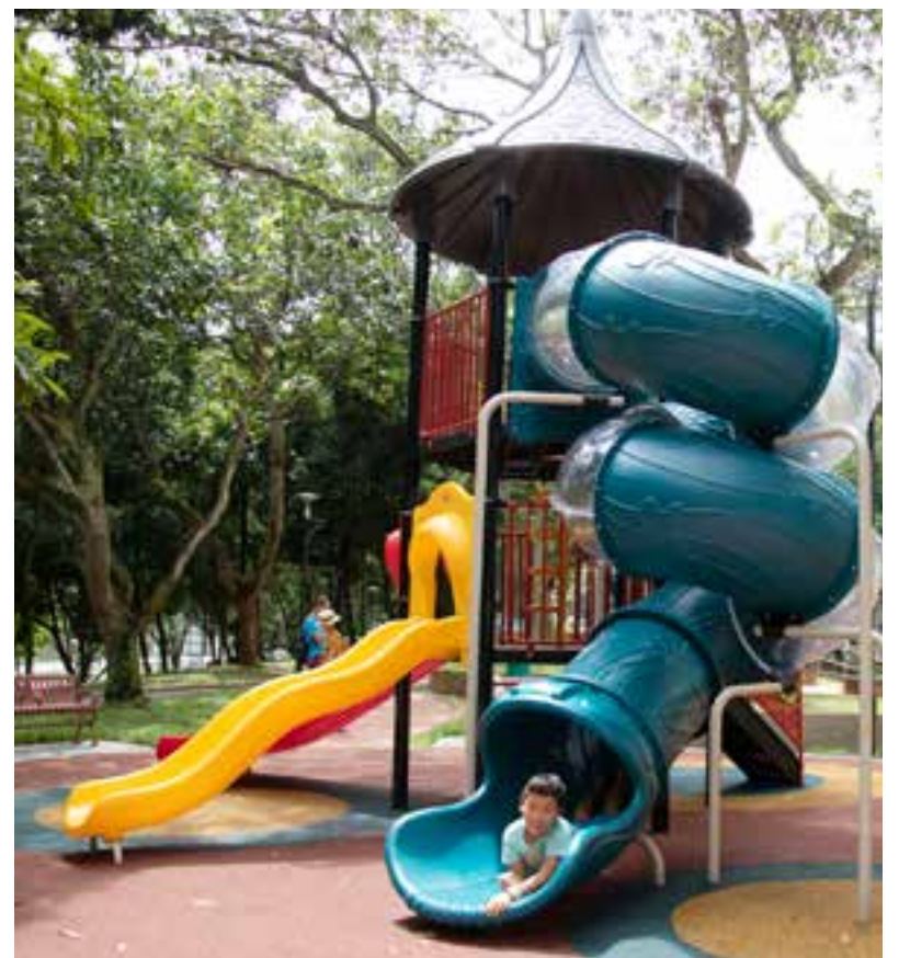
Upgraded playground at Block 209 and 210 Jurong East Street 21.