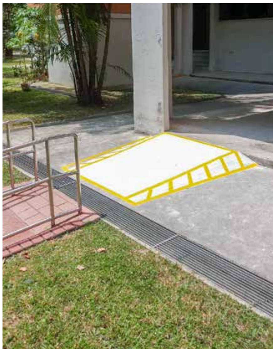
Barrier-free ramp at Block 430 Jurong West Ave 1.