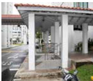
Barrier-free access at Block 225 Bukit Batok Central.