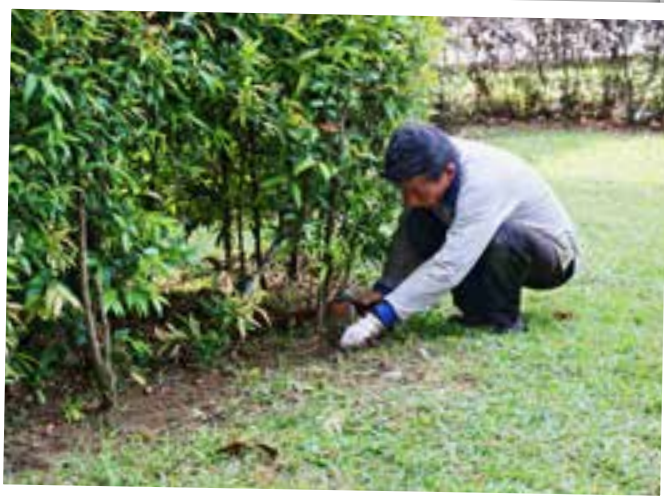
Overgrown weeds are removed so that they do not absorb nutrients meant for other plants.