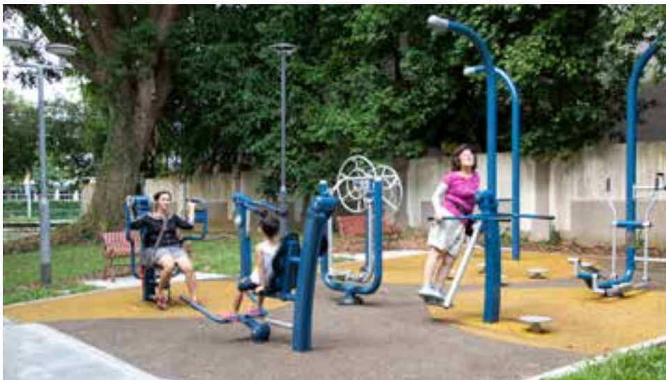
Upgraded playground and fitness corner at Block 327 Jurong East Street 31.