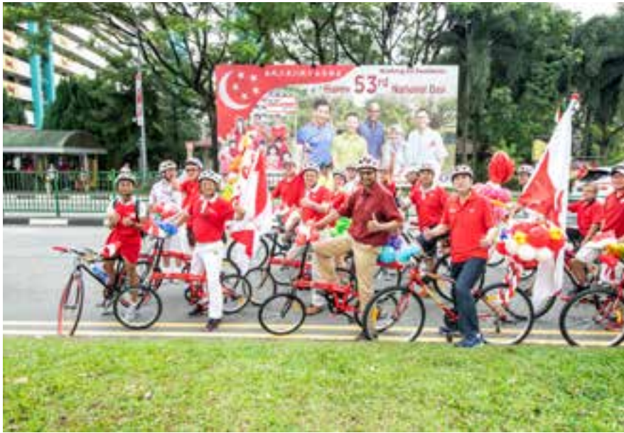
DPM Tharman and residents cycling after taking part in the Taman Jurong National Day Observance Ceremony.