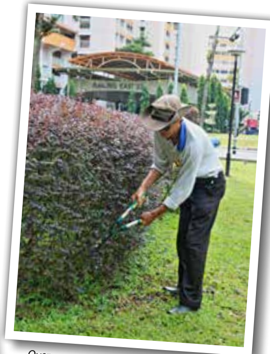
Overgrown shrubs are trimmed regularly to maintain a neat appearance.