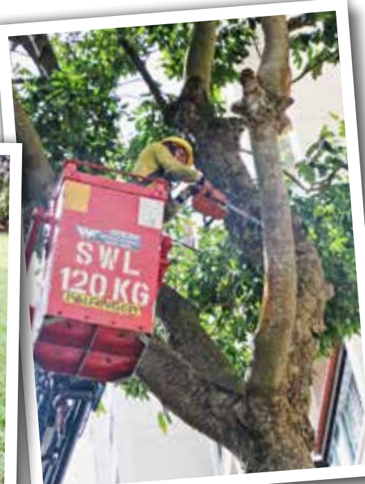
Pruning trees keeps them healthy and structurally safe.