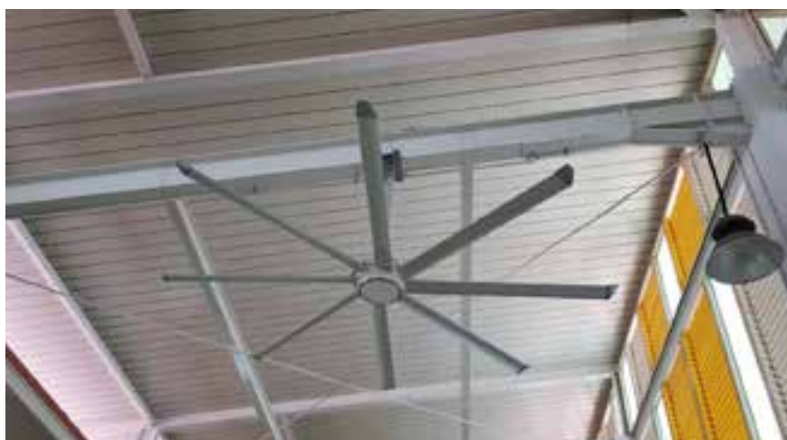
Installation of four high volume low speed (HVLS) fans at the hawker centre of Block 448 Clementi Ave 3.