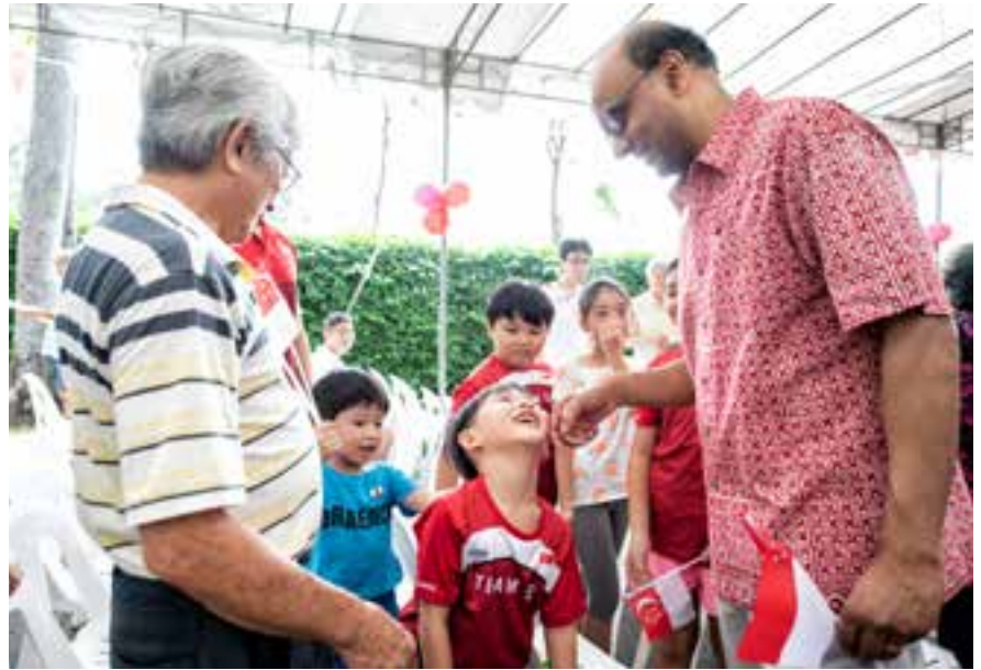
DPM Tharman (right) interacting with a family at a National Day event.