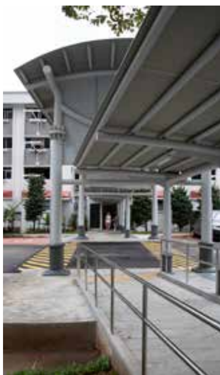
New linkway between Blocks 141 and 143 Bukit Batok Street 11.